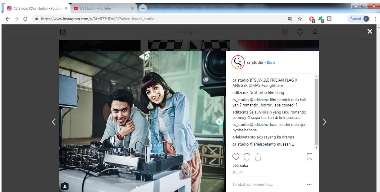
Figure 2. Examples of videos and photos Figure was adopted from www.instagram.com . On Dec 10th, 2018

In the initial display in the form of photos and videos here the customers can see the work exposed CS_Studio Instagram which is of course interesting and unique. To see examples of photos and videos in CS Studio customers can view photos and videos that have been recommended by Instagram (see Figure 2).