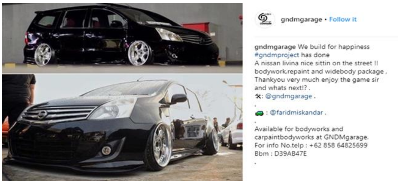
Figure 4. Information about modified their cars

According to M Saravanakumar, T SuganthaLakshmi Facebook would be a natural fit for internet marketing and enhancing the company's authority [15] (see Figure 4).